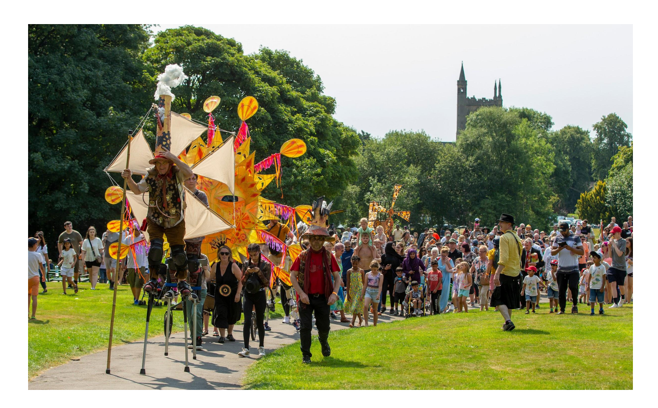
'SPARK!' parade, Falinge Park, Rochdale, Aug 2022