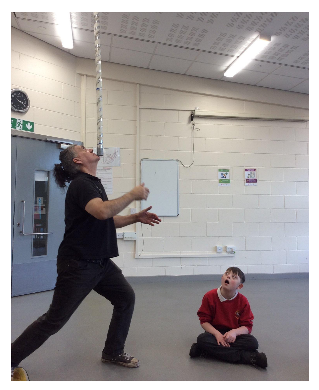
Master and apprentice, Children In Need funded project, June 22