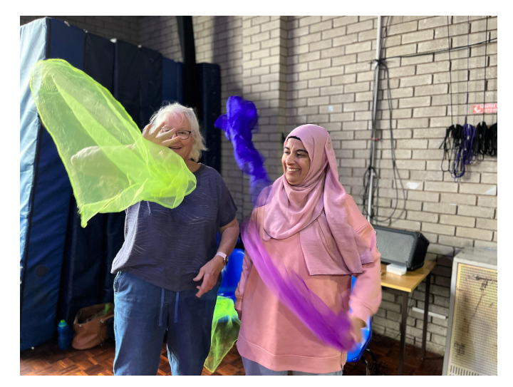
"Every school needs Skylight" Primary school teachers at the Circus Sparks train-the-trainer pilot

Circus Sparks skill flash cards were provided to all the pilot schools along with tutorial videos and 'circus in a box' equipment for use in school