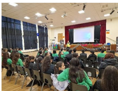
Picture 9 – Roma Day Cardiff