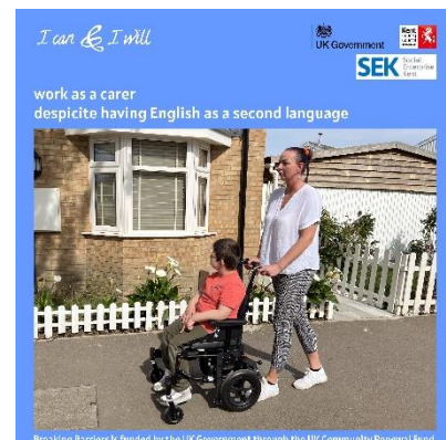
Picture 14 - Campaign