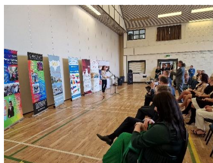
Picture 2 – Official launch