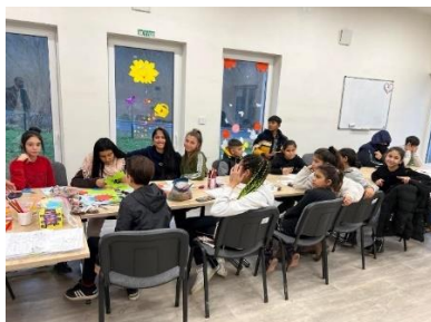
Picture 28 – Community centre