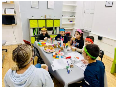
Picture 12 -Youth engagement