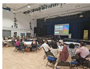
Picture 10 – Roma Day Peterborough