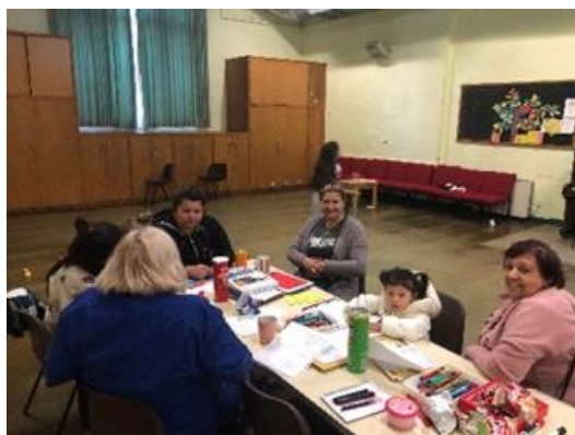
Picture 13 - Family engagement

We have also been funded by SEK (Social Enterprise Kent) for creating a campaign that will promote various jobs to migrant communities and also enable employers to recruit easier.