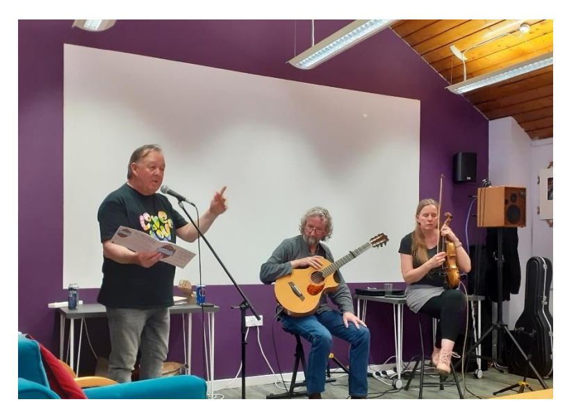
Poems & folk music in the Lounge

Now that we have completed the work on our two community rooms, we are turning our attention to improving the main library. We are hoping to change the outdated fixed reception desk in a way to provide a modern welcome area. This would also enable us to create a large space in which to hold larger events such as ceilidhs, music nights etc.