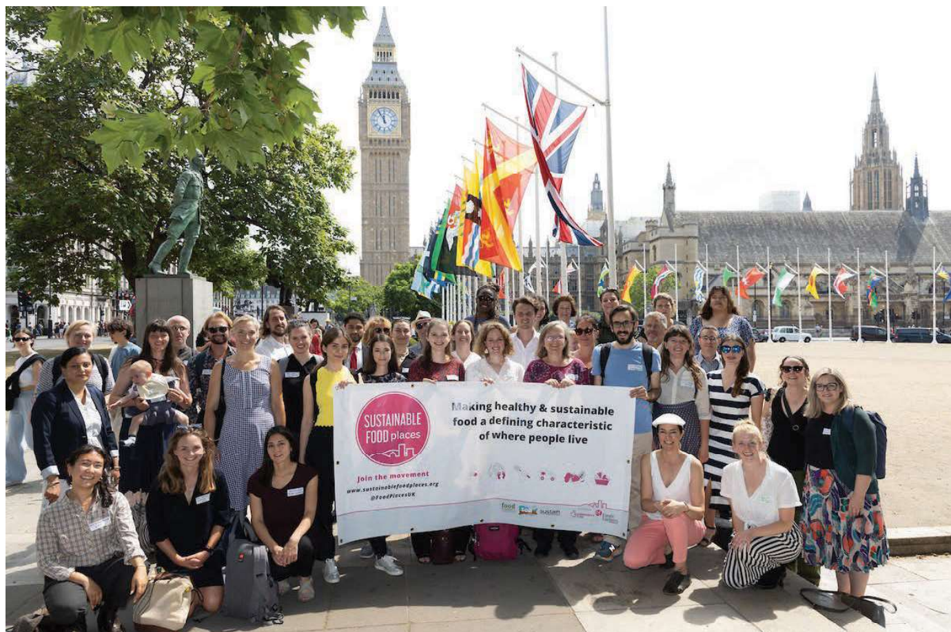
Leaders of local food partnerships from across the country gather for the Sustainable Food Places day of action and celebration in Westminster. The day was an opportunity to put the amazing work of food partnerships on the radar of local MPs, and to put out a call for: One food bill for every nation; One food plan and partnership in every local area.

The value of food partnerships was also evident in focused campaigns and initiatives coordinated by Sustain, helping local authorities and institutions to reduce the climate and nature impact of food