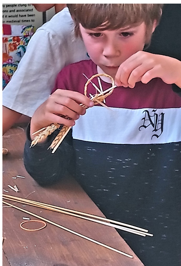
Children's Corn Dolly Workshop

Discussions with English Heritage are ongoing regarding group visits to the Centre for their Members' Days Out.