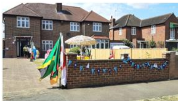
Ministry Mission Home

The Ministry contributed by bringing and sharing food from their heritage and we even sang National Anthems of the people represented including Italy, Jamaica and Great Britain