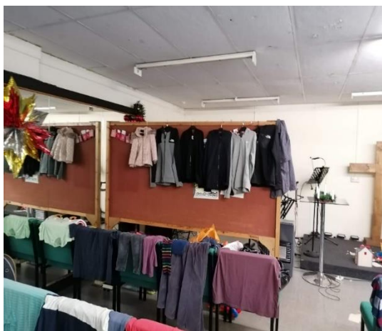
2 DECEMBER CLOTHING DRIVE

Despite the loss of Council funding, Centrepont Support Centre continues to provide essential services to our community. We offer referrals for benefit advice or debt counselling to those who face financial challenges.