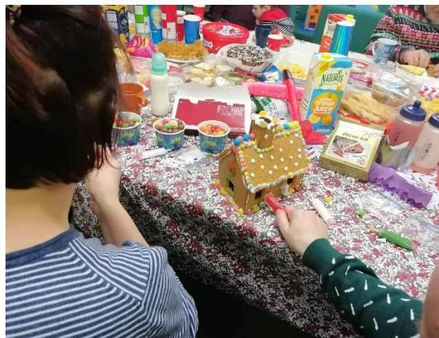
1 CHRISTMAS PARTY FESTIVITIES