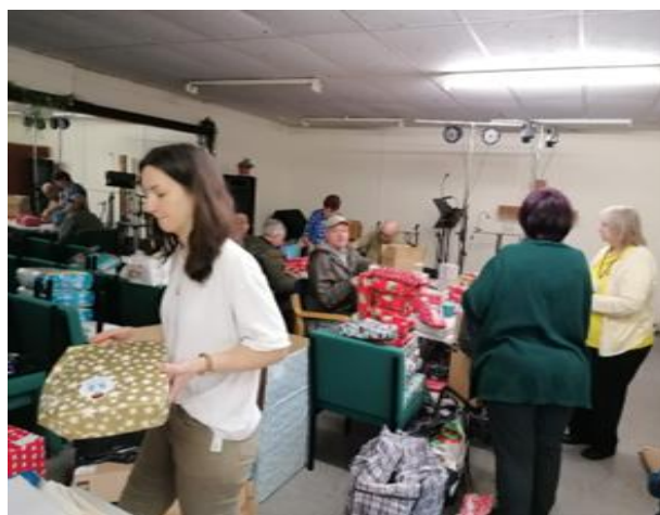
3 VOLUNTEERS ORGANISING FAMILY CHRISTMAS HAMPERS

Throughout the year church members and volunteers collected toys, toiletry sets, food and clothing. We made use of In Kind Direct to access a wide range of products to fill the hampers to give away to the people we support. This continues to be a significant resource in aiding this initiative.