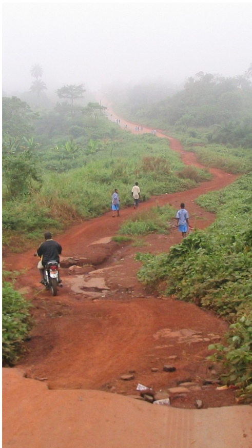
The road to Amaudo