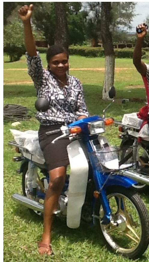
New bikes for Project Comfort

"I am highly motivated by the allocation of a new motorcycle for my fieldwork because I can now keep up with the appointments for clients and their families, unlike before when the old motorcycle would develop a fault on the road thereby resulting in the delay or cancellation of an appointment. I have also saved money from frequent repairs of old motorcycle as I now do not visit the mechanic unless the servicing is due. The new motorcycle has raised the confidence of the clients' families and the society in me because when I used the old motorcycle to visit my clients they seemed worried because of our inability to purchase a good motorcycle which made them not believe that my services could be of help to them. I am happy because more children with disabilities are seen and supported every day. Many thanks to Amaudo UK ."