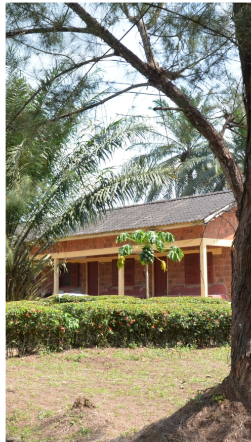
House at Amaudo

"The reroofing of 5 residential houses has been completed and the houses have become stronger and more conducive for living. They have been saved from dilapidation and perhaps collapse. The houses also have better value now. We are very thankful to Amaudo UK and all who donated funds for this project."