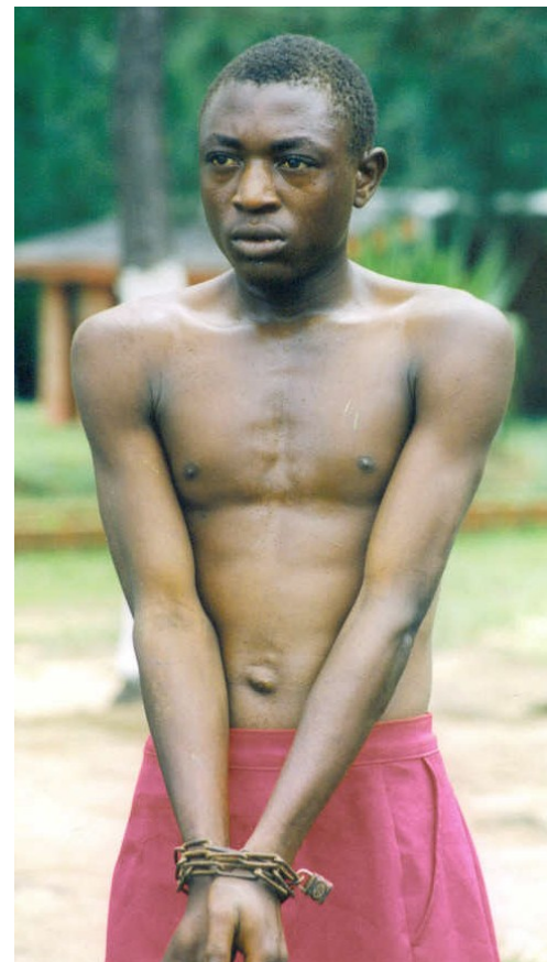
Challenging Human Rights Abuses