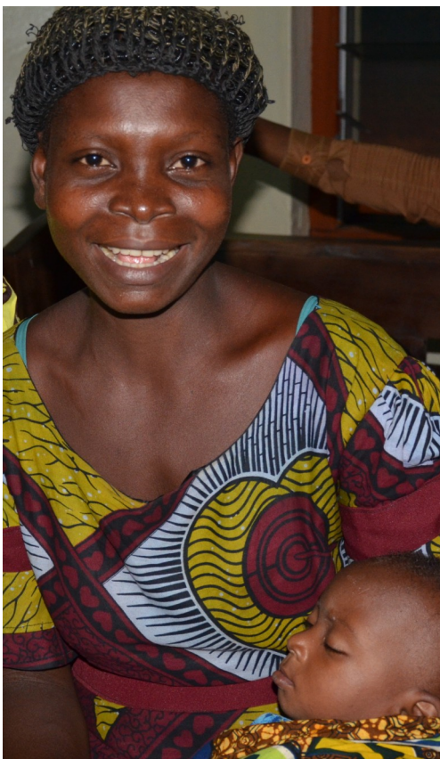
Family member celebrating repatriation