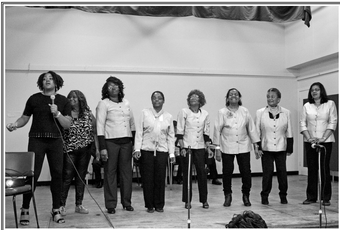
The Gospel Choir in action at the end of the Black History Events Evening Organised by the Missionary Committee in the Victoria Hall on Saturday, 17th October 2015