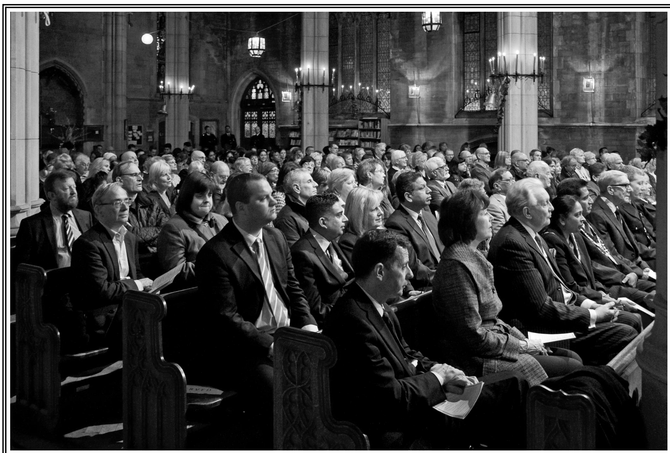
The Congregation at the Metropolitan Police Community Carol Service Wednesday, 16th December 2015