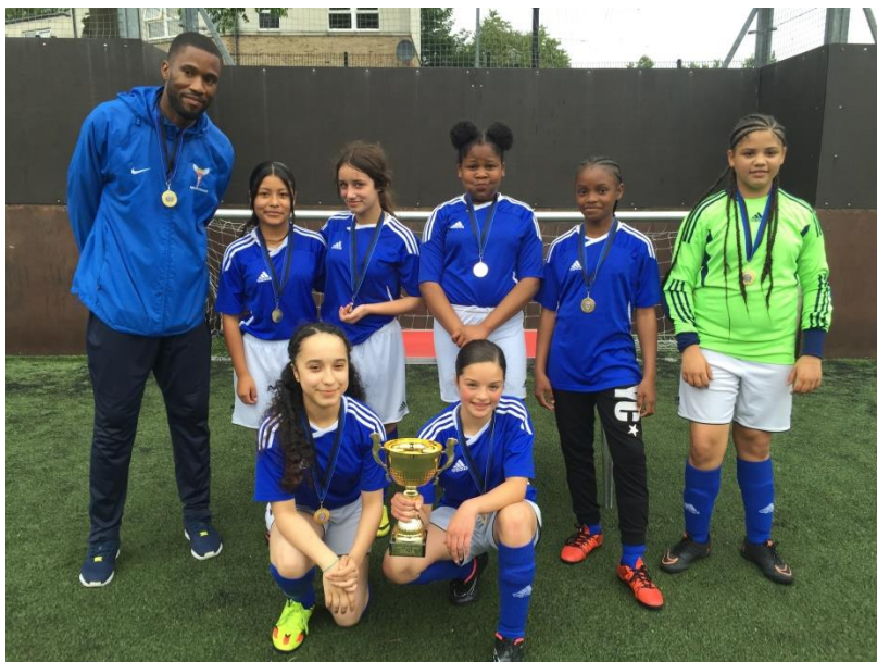
Platanos College, Year 7 & 8 Champions

As part of the CSAF Programme we also delivered a women's 6-a-side football tournament at the 2016 Lambeth Country Show in partnership with the London F.A. Five teams produced some very entertaining football, attracting quite a few spectators to the show's Activate Zone, with the South London Laces A team being crowned champions on the day.