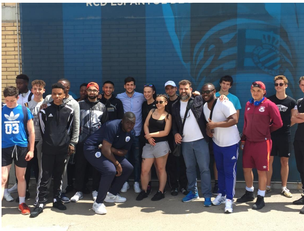
BTEC students at Espanyol