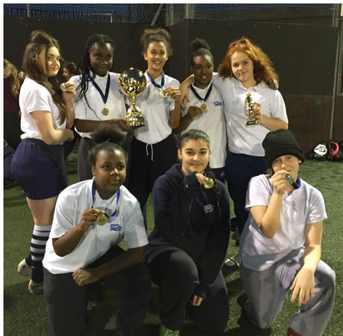
Oasis Academy, Year 9 & 10 Champions