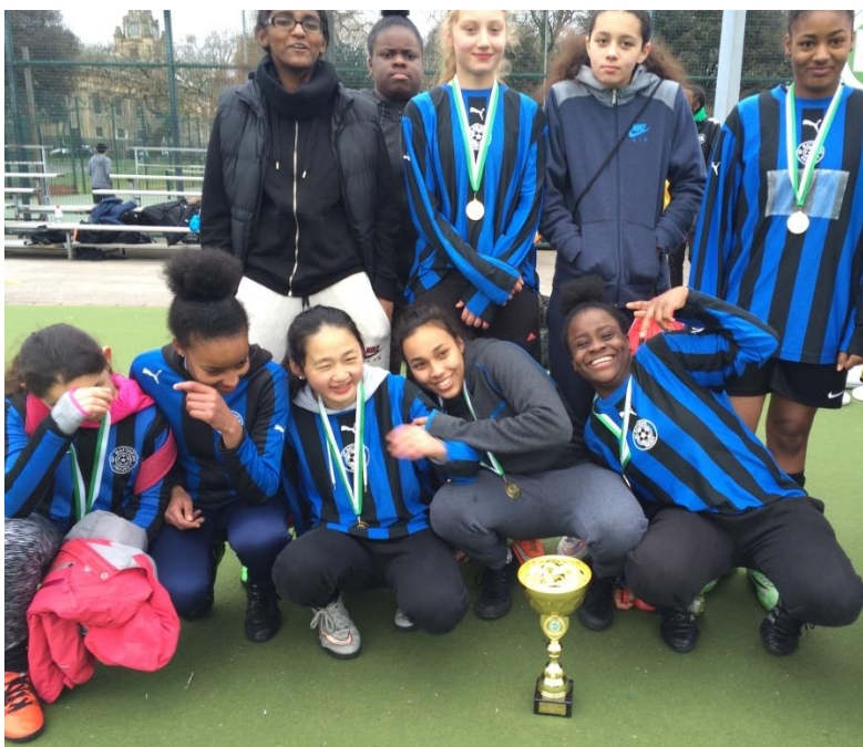
Saturday Club girls with the BKF trophy