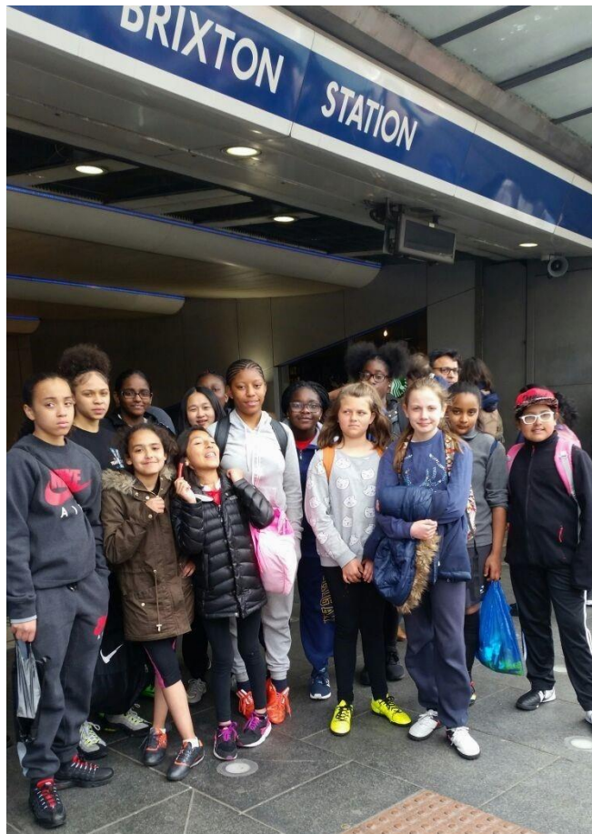
Saturday Club girls en route to Wembley