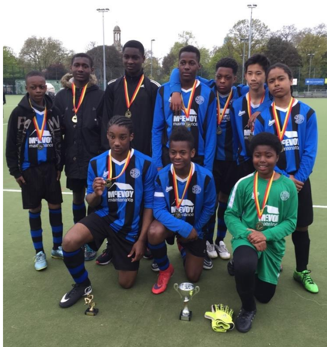
U14s @ Kennington Park

A big thank you goes out to McEvoy Maintenance for sponsoring our U14s and U17s kits this season.