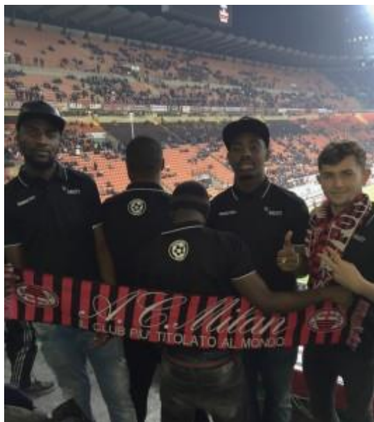
SMP members at the San Siro for AC Milan v Atalanta

In May 2016 a second cohort of BTEC students went on a 2-week work placement in Barcelona. The students were hosted by RCD Espanyol and got to see how a small club can survive in La Liga, in the shadow of one of Europe's footballing giants, by running a top class youth academy and scouting network. They also got to visit the famous Camp Nou stadium, home of Espanyol's city rivals Barcelona F.C. They did manage to enjoy a day off, too, to take in the Pentecost carnival and the beach!