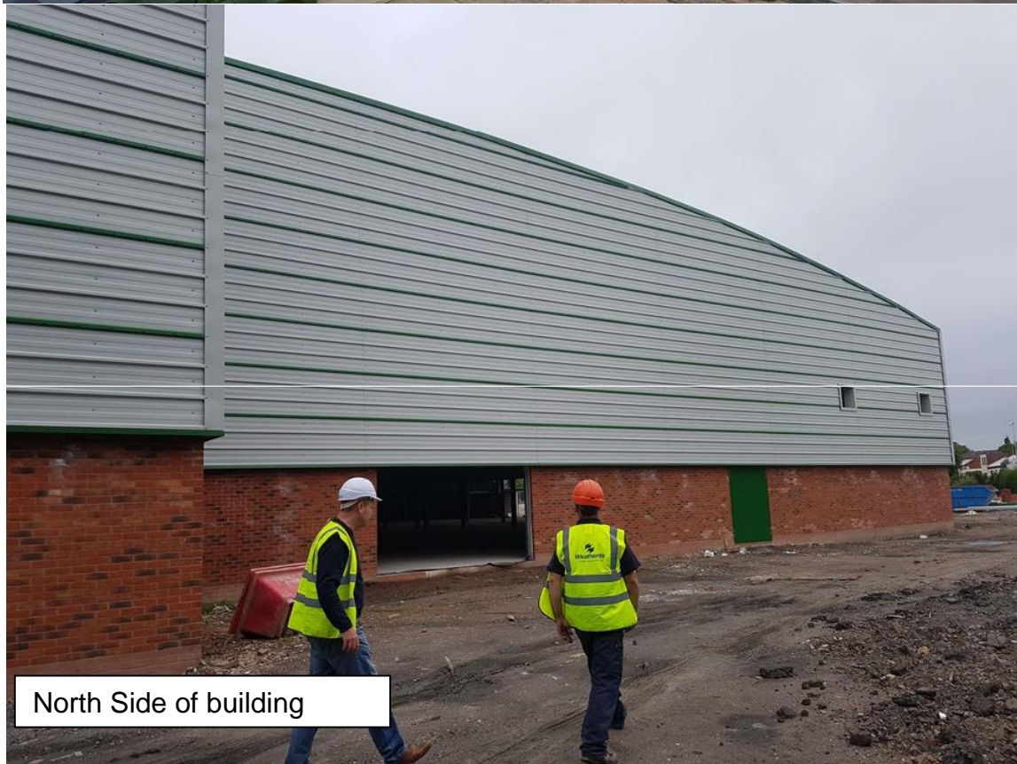
North Side of building