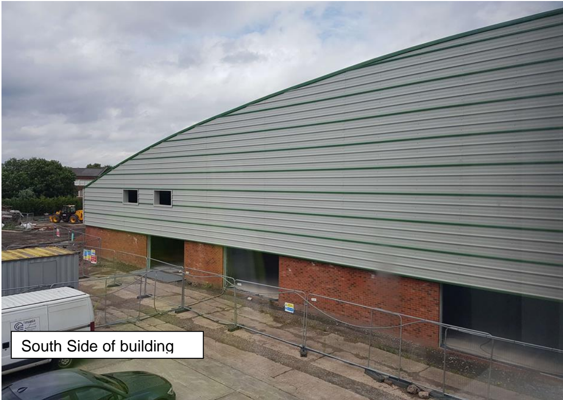
South Side of building