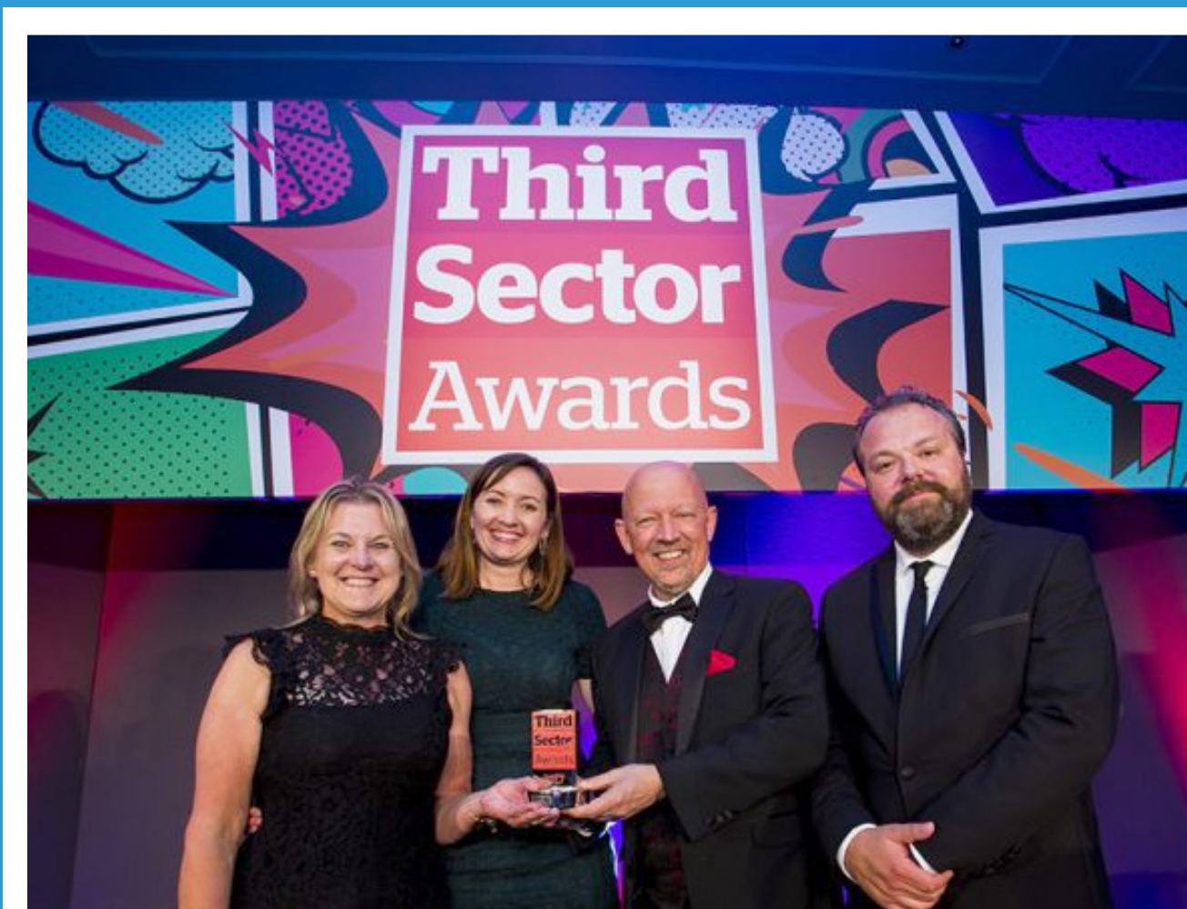
The Grand Appeal receiving its Third Sector Award for Enterprise

The Grand Appeal is delighted to be recognised by its peers in the charity sector and the general public for its primary purpose activity and wider fundraising and marketing.