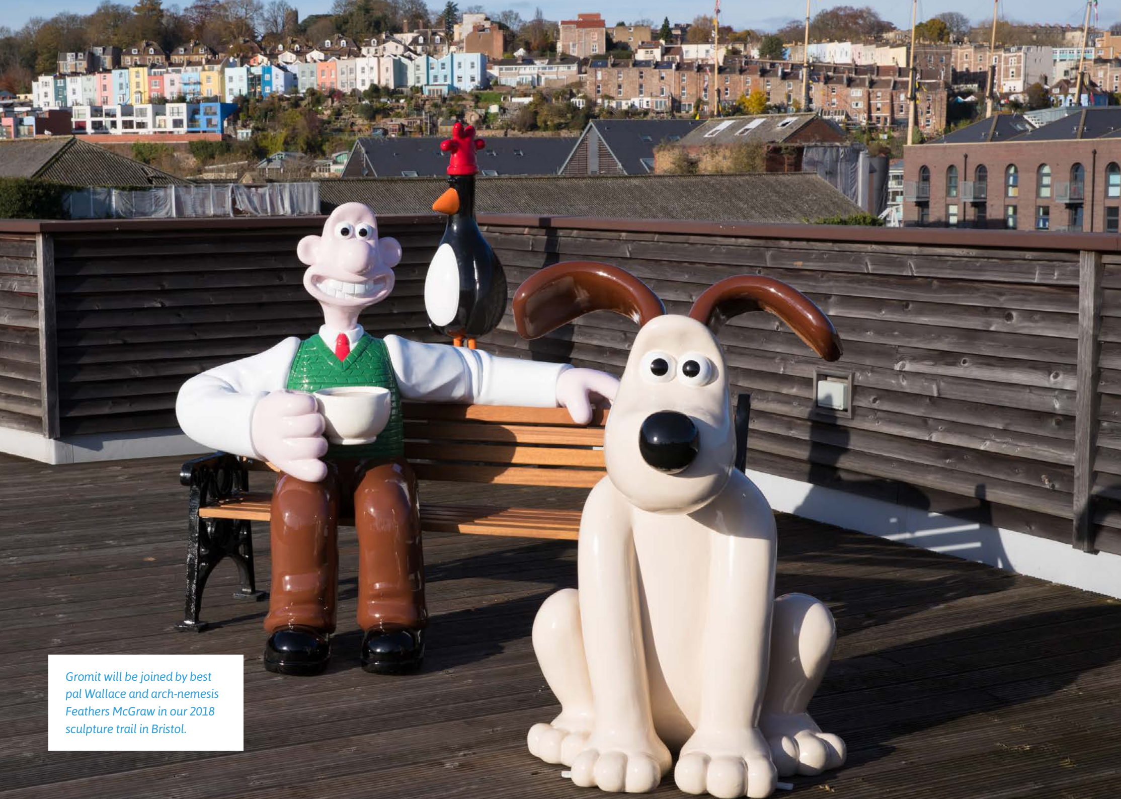
Gromit will be joined by best pal Wallace and arch-nemesis Feathers McGraw in our 2018 sculpture trail in Bristol.