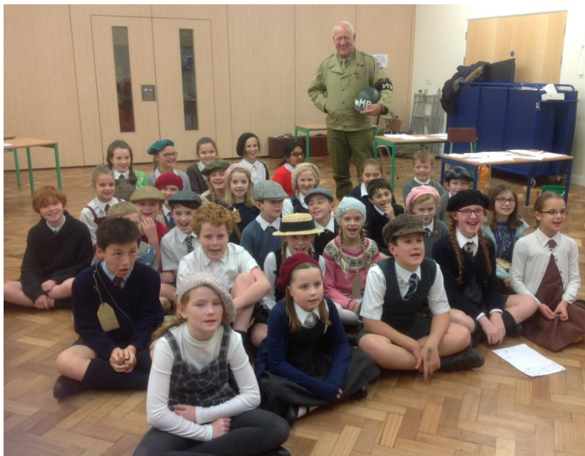
Year 6: WW2 Day

Each year group received funding for a topic-related Enrichment Day