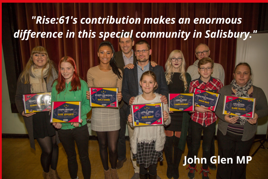
John Glen MP

"Rise:61's contribution makes an enormous difference in this special community in Salisbury."