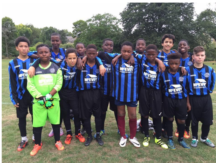
U13s with their new kit for the 2016-17 season

A big thank you once again to McEvoy Maintenance for their continued generosity and kit sponsorship. Also, to In Kind Direct who provided 12 pairs of brand-new Astroturf boots at a huge 90% discount!