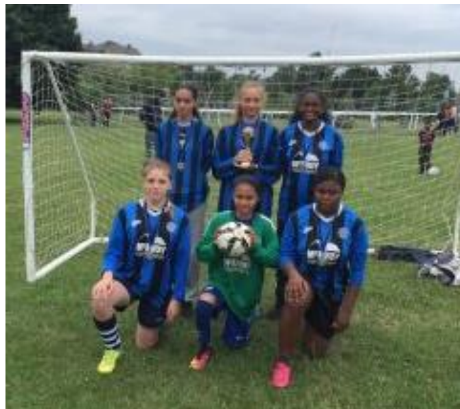
SMP Girls, Lambeth Country Show Junior Champions

The St. Matthew's Project's Female Football Festival in the Activate Zone at the Lambeth Country Show in Brockwell Park on 15 & 16 July was a brilliant advert for the women's game. On the Saturday our own SMP girls triumphed in the 11-16s age group after a dramatic final against CEF Linx girls from Lewisham, after extra time and penalties. On the Sunday we hosted our women's tournament, which saw an amazing 14 teams and 95 players from across London taking part. Congratulations to Latin American Women United who were crowned champions and a big well done, too, to our runners-up Brentford Ladies. A special shout went out to our youngest entrants, Swift F.C, who came all the way from Hayes, Middlesex.