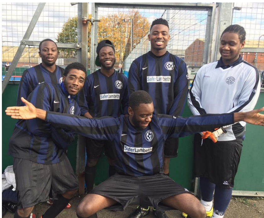
Elders at Croydon tournament