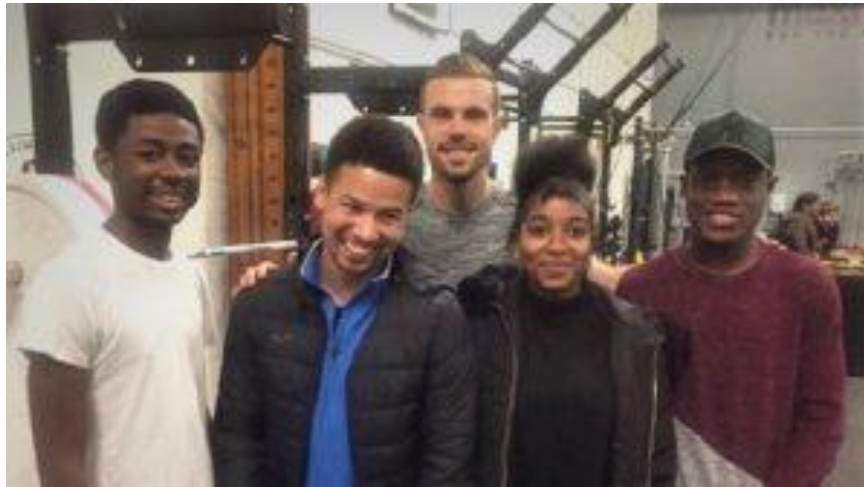
Jordan Henderson with BTEC students

There was also a great surprise in February for some of the BTEC students as Liverpool F.C and England star Jordan Henderson dropped in on them at the Black Prince Hub, Kennington. Jordan answered questions on what life is like at a top club and encouraged the students to work hard at whatever they chose to do in life.