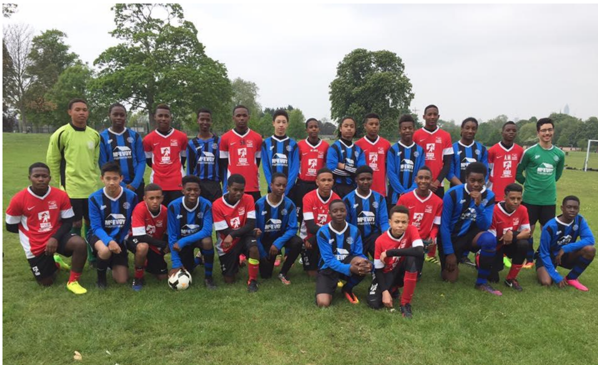
Les Amis de Martinique