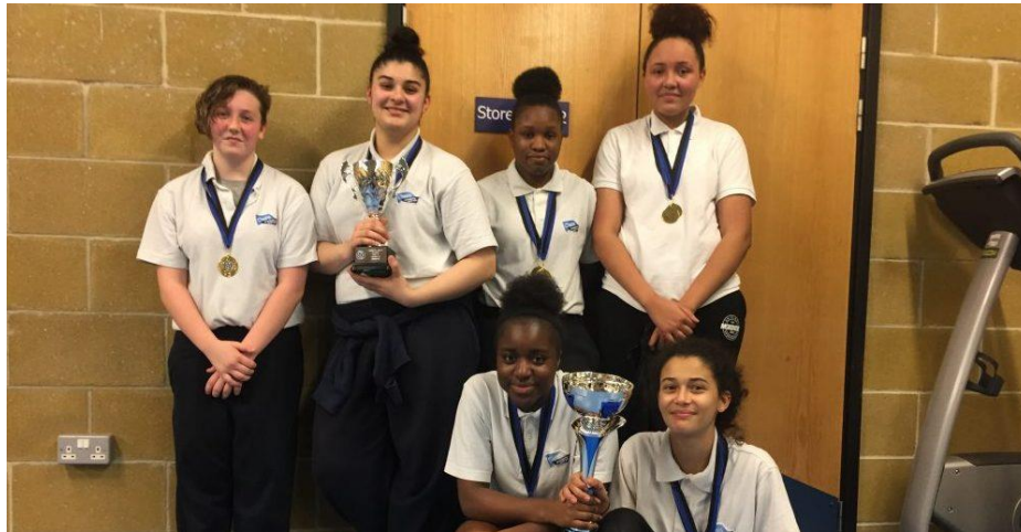
Oasis Academy, Year 9 & 10 Champions

so it was great to see the league growing. We were also pleased to welcome special guests, Southfields Academy from neighbouring Wandsworth. Due to the large number of teams taking part this season, we ran the league with two divisions, with the winners of each going head to head in an NFL-style play-off to be crowned overall champions. 1 February 2017 saw the grand final take place at Ferndale Community Sports Centre, Brixton, between Norwood and Oasis Academy, Waterloo, with Oasis once again being crowned champions.