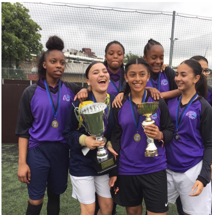
Norwood Girls, Year 9 & 10 Festival Champions

Total throughput participants Lambeth Girls' Schools Programme = 678