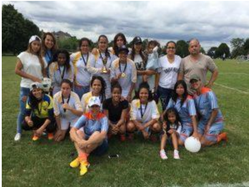
Latin American Ladies, Lambeth Country Show Women's Champions