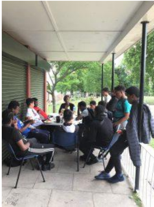
Wellbeing workshop, Brockwell Park