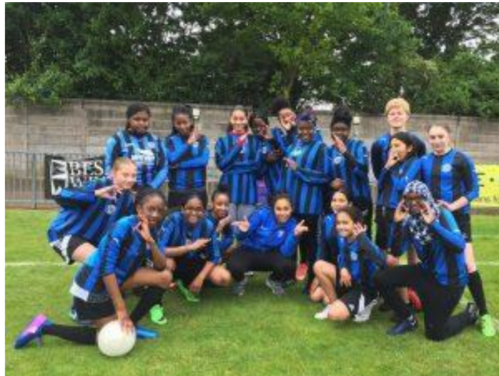
SMP girls at Dulwich Hamlet