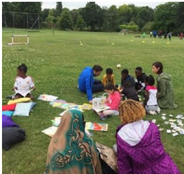
Parents & toddlers enjoying a session in Brockwell Park

The Parent & Toddler reading and football club was launched in March 2017 at Jubilee Primary School, Tulse Hill and is aimed at encouraging parents to read to their children more regularly and help build parents' confidence both in themselves and in using St. Matthew's Project facilities, whilst enabling them to develop their friendship groups and increase access to sport. Children aged 3-5 were able to play football in a fun, family environment which aids early development skills such as agility, balance and coordination. It also offers the chance for parents and guardians to spend time engaged in reading activities with their children, helping them to lay a solid foundation for their future academic development.