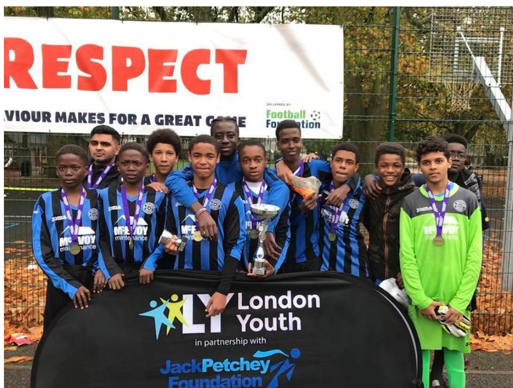
U14s, London Youth Champions 2017

93 SMFC players registered with the London County Saturday Youth Football League