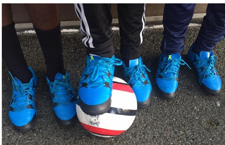
New Astroturf boots