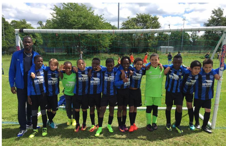
...and with the U10s at Club Langley

In May we welcomed MFR Martinique F.C to Brockwell Park. The boys were on a 10-day trip to London and were looking to play a friendly. They also took in the sights Brixton after the game. It was a great experience for our boys to meet and play against young men from a different culture. The game ended fittingly in a draw.