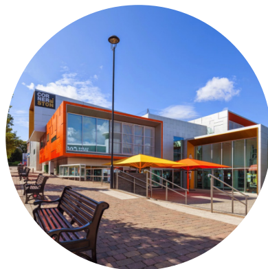
Cornerstone Arts Centre

In 2017, after many hours of planning and preparation, we moved to the accessible Cornerstone Arts Centre. We are grateful to the management and staff at Cornerstone for welcoming us into our new home. The staff and visitors now have the benefit of fully accessible lifts, Changing Places toilets and doors, and a vibrant café for families to meet and greet before and after sessions. We are now in a very strong position to develop our community programme in partnership with families and partner organisations.