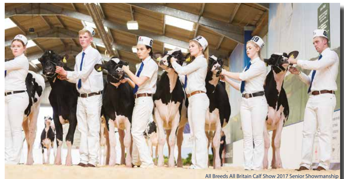
All Breeds All Britain Calf Show 2017 Senior Showmanship