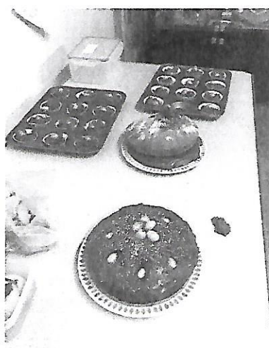
Examples of baking we have done as part of the Duke of Edinburgh – Skills section