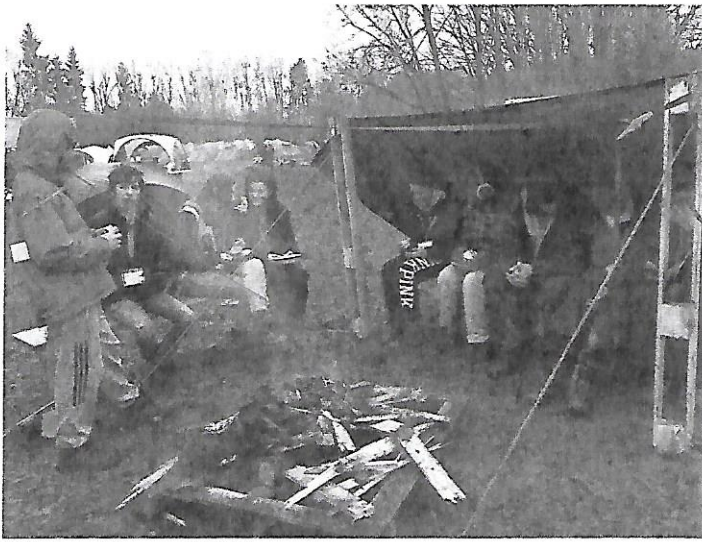
Winter Camp 2018