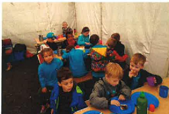
Breakfast on Taster Camp

May saw us on District Camp at Ennerdale where the Beavers launched water rockets, and climbed along the low ropes. In June we had a Taster Camp, where we purely camped and played games much to all our enjoyment. Our newer Beavers got a taste of being under canvas and camp breakfast, yummy. And then finally in July we were on Group Camp. The Beavers got to experience a mammoth water slide, built by the Scouts. They lit fires and sang at the camp fire.