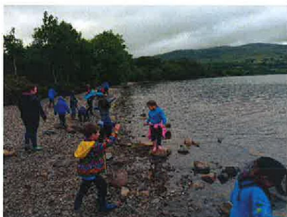
Pebble skipping on Taster Camp