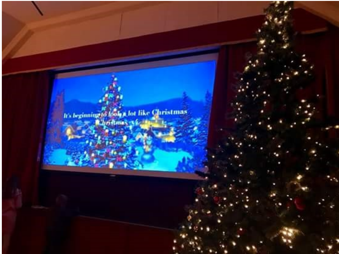
Figure 4.1: Carols and Cider

This was our first social event held on the 1st of December where all members of the church were invited to sing carols, have a social drink and eat mince pie(s) whilst decorating the hall up with Christmas decorations