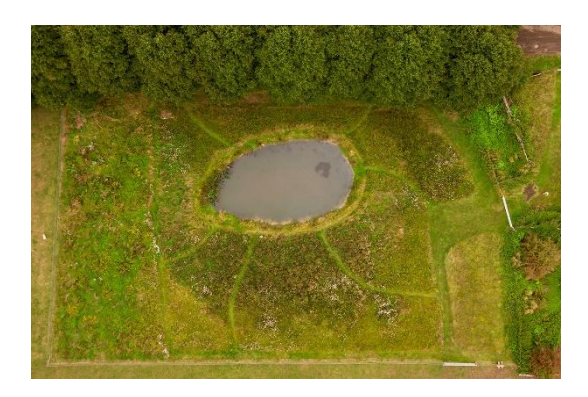
Aerial view of Froyle Park Pond area