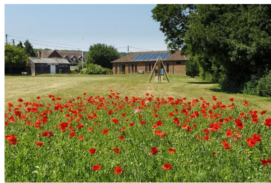
Wildflowers on Froyle recreation ground