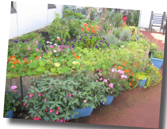
Improved outdoor garden area at Hauxley Ward, St. George's Park, Morpeth