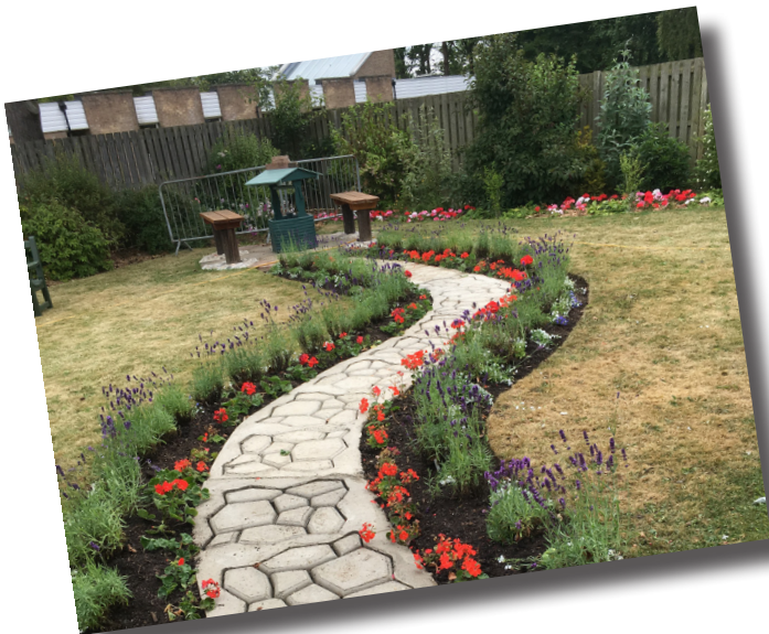
Recovery Gardens at Northgate Hospital, Morpeth