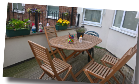
New garden furniture at Elm House, Gateshead