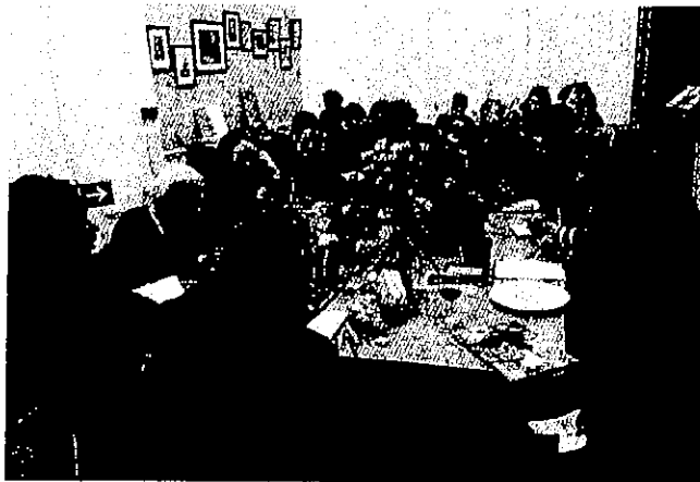
"Plant Drawing - February 2018"

We aimed to maximise public benefit by making our open days and all other events welcoming to people of all ages and backgrounds, to ensure that everyone, regardless of their age, abilities or knowledge, can engage with the wonderful world of plants.