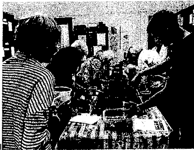
"Making mini rain gardens June 2017"