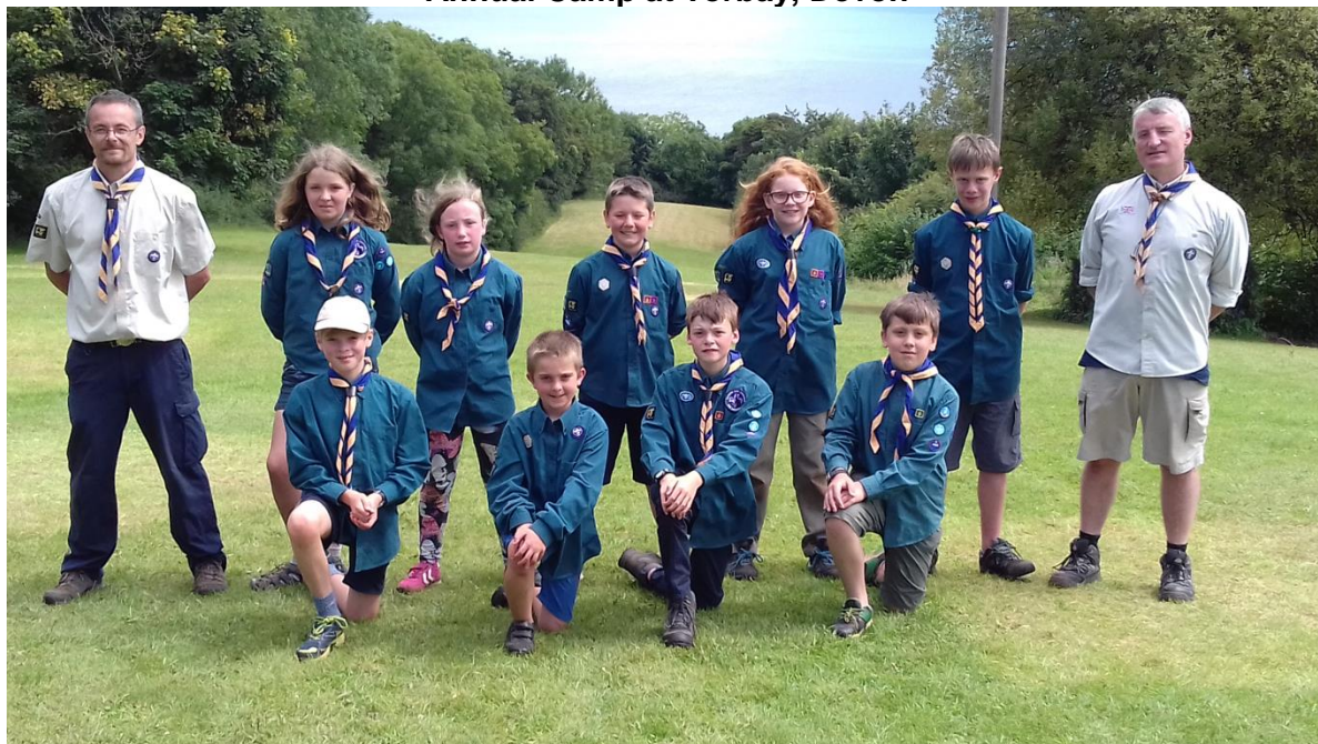
Annual Camp at Torbay, Devon

The year started off with our summer camp at Torbay in August last year. We had a fantastic week and were certainly blessed with great weather. The scouts set up camp and cooked their own meals and washed-up all week. During the week they went on a hike to Hay Tor on Dartmoor, a boat trip to Brixham, several beach visits, a trip to the flume park, shooting, and grass sledging, to name but a few activities.