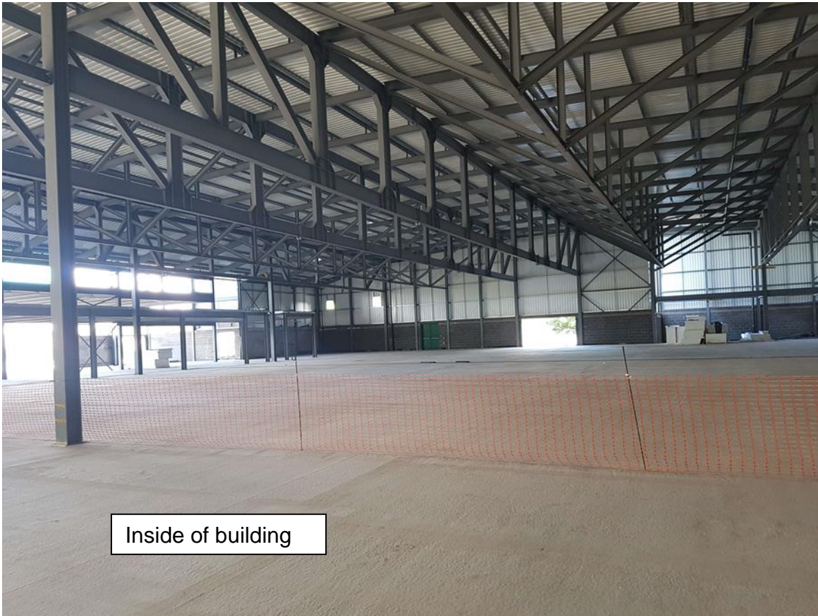
Inside of building