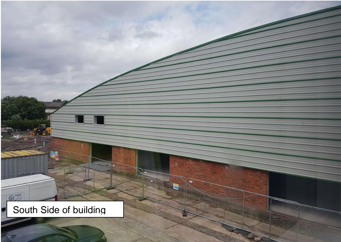
South Side of building