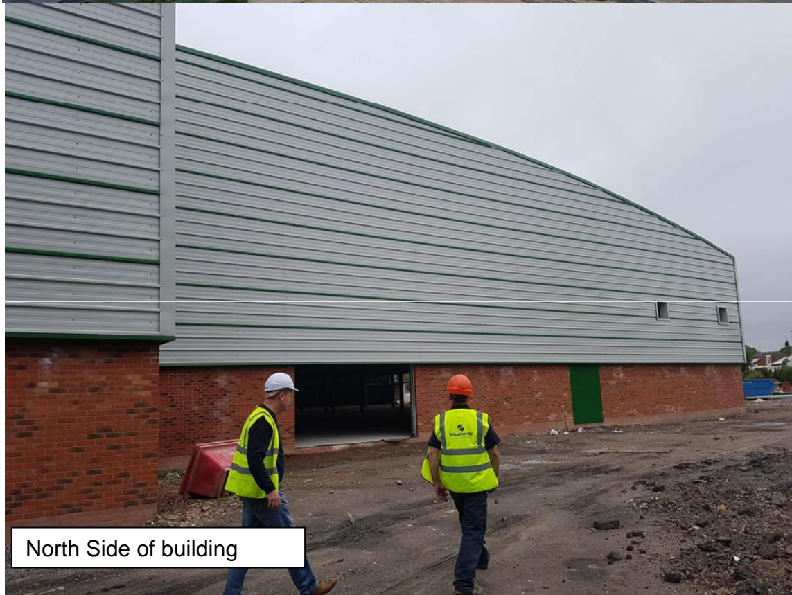
North Side of building