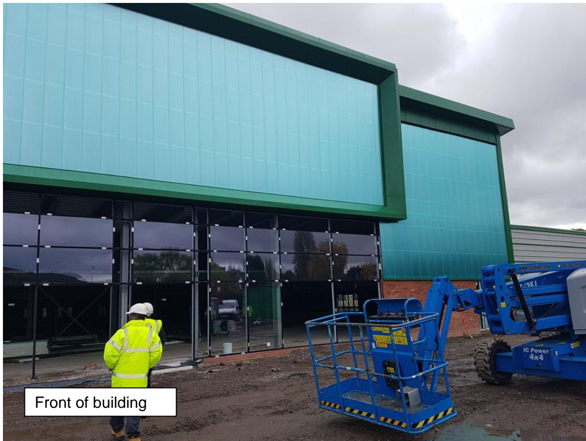
Front of building