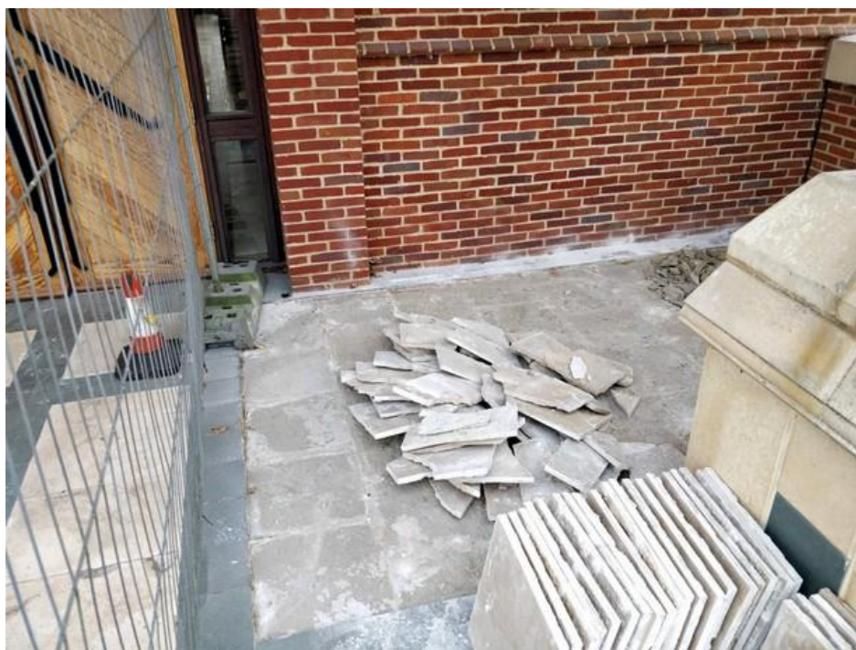
Repaving the porch at the main entrance to the abbey church

There has been no major expenditure on the buildings during the year, only routine maintenance and some small-scale enhancements. One smaller project completed by our own staff was the repaving of the porch at the west door of the Abbey Church, which had degraded over the years and had become potentially hazardous. There was some movement in tenancies in our rental properties. We are pleased that our playing fields, and their new pavilion, remain well used by the local community. The pavilion offers an affordable venue for functions in a clean and modern setting. On the upper level is a space used by the association of alumni of our former school to house a small museum of school memorabilia and artefacts.