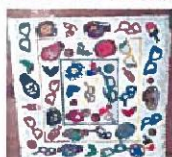
Drawstring Bag Project