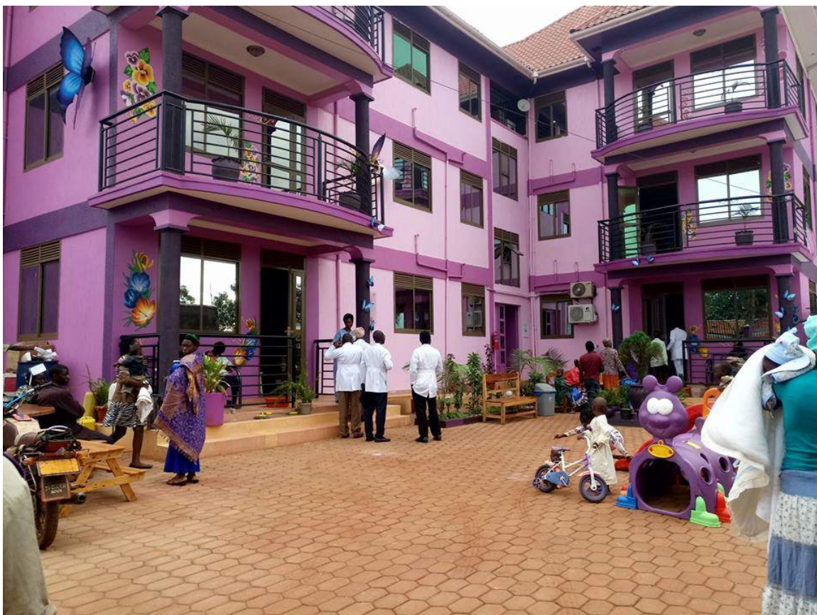
Whisper's new hospital at Madhvani Road, Jinja, Uganda