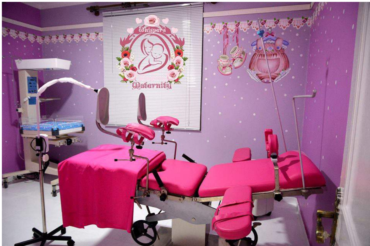
Delivery Room in the new maternity facility

In March 2018 Whisper's hospital moved to a new, larger site at 32 Madhvani Road, Jinja. In June 2018 the hospital opened a maternity department, including an operating theatre for C-sections, 4D Doppler ultrasound and antenatal classes.