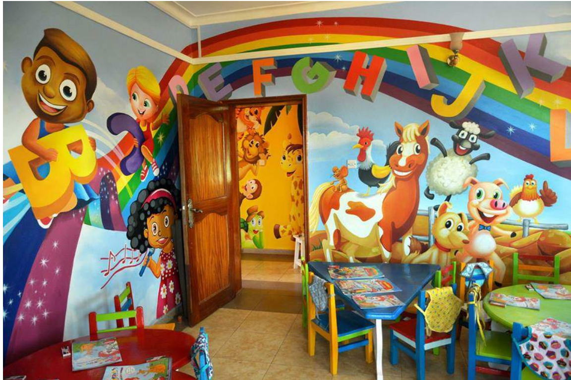
Hospital classroom for inpatients and staff children

Whisper continues to operate a nursery and primary school at Kagoma Gate. The hospital now also has its own onsite classroom.