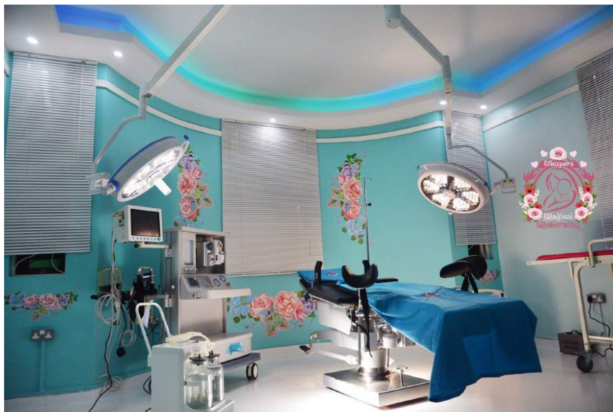
Main operating theatre in the new hospital