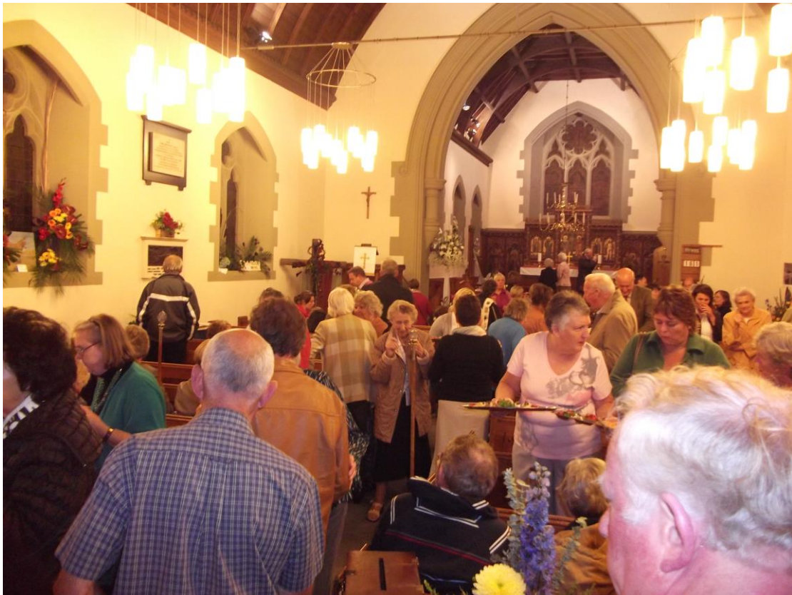
Flower Festival at St Matthew's