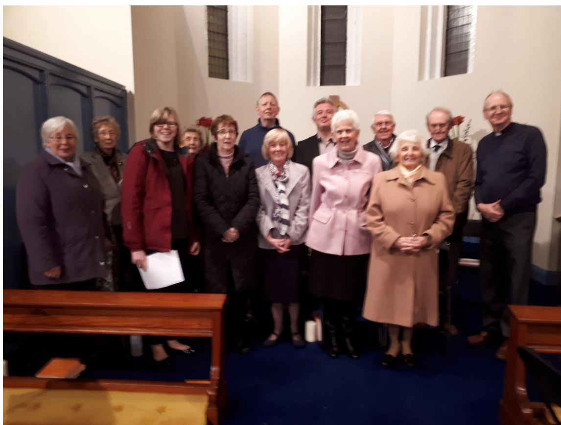
The team choir at St Cuthbert's

Lloyds Bank plc 32, The Gosforth Centre, High Street, Newcastle upon Tyne, NE3 1JQ