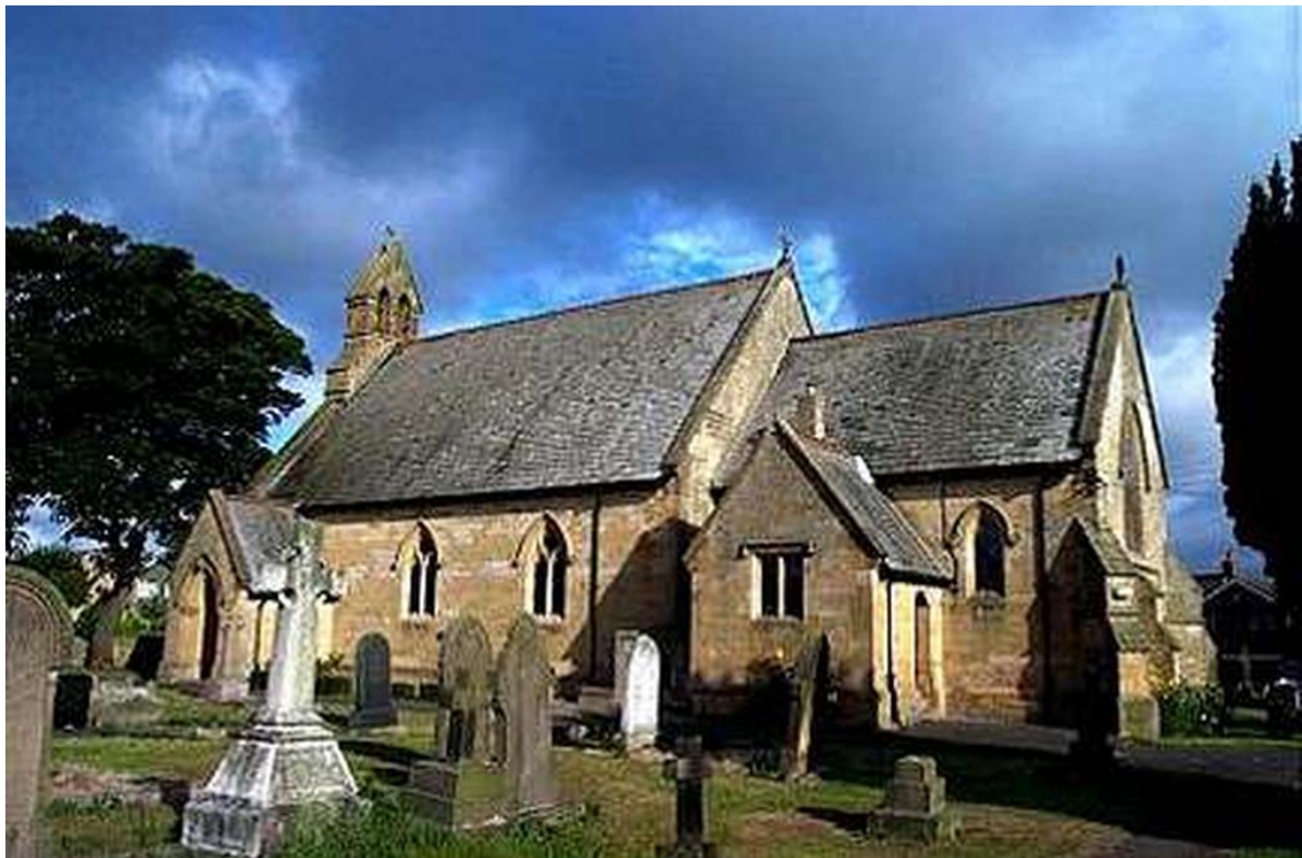
St Matthew's Church, Dinnington