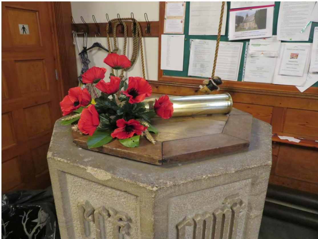
An arrangement at St Matthew's for Remembrance Sunday 2018