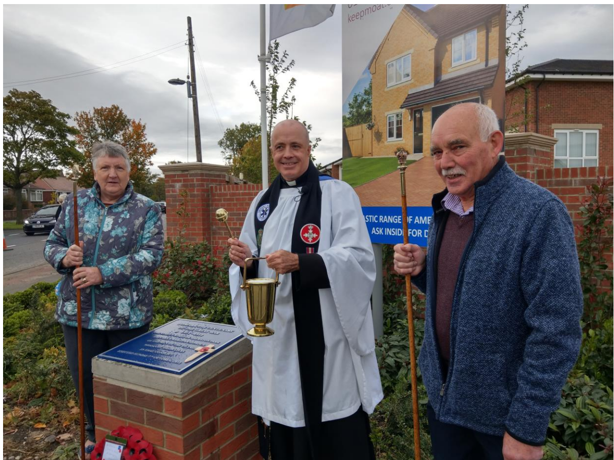
Dedication of the memorial plaque at Sheraton Park to villagers of Dinnington killed in World War 1. An important link with a newer part of the village.

Supportive relationships were strengthened with the Newcastle West End Food Bank, Various schools are enabled to hold their Christmas, Easter and Harvest celebrations in the churches.