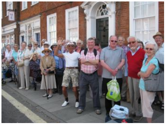
enjoyed an ice-

Our summer outings were blessed with wonderful weather ensuring a good day was enjoyed at each location. Our day at Wisley Gardens was the first of our trips and looked magnificent. We had timed our visit well as the azaleas and rhododendrons were in full bloom making a fabulous display. The group were able to take advantage of the buggy tour of the grounds which meant everyone had an opportunity to see the furthest end of the gardens which are extensive. Everyone agreed it was a great day out and we all enjoyed the lunch in the restaurant and a visit to the gift shop before returning home.