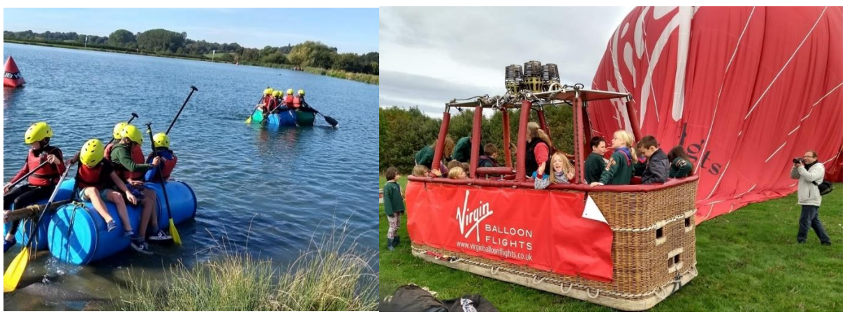
Rafts on the Lake / Impromptu air-air ballon

We also camped overnight at with other packs in the district as part of the Water Activities Day at the Top Barn/Lakeside campus in Worcester. This saw the cubs building and racing rafts, manoeuvring canoes and playing stuck-in-the-mud in kayaks on the lake. For an unscheduled treat, we had a hot air balloon fly very close overhead at breakfast, followed by the support vehicle pulling up and saying "Want to see the balloon?" Everyone quickly abandoned their cereal, yet-to-finish-cooking bacon was turned off, and steaming mugs of tea were left on tables, as the entire camp headed 2 fields over to the balloons landing site. I imagine it looked like some sort of Marie Celeste of campsite when parents started arriving to pick up their cubs! The cubs did enjoy climbing in the balloon's basket, and helping to deflate the balloon as it laid down in the field!