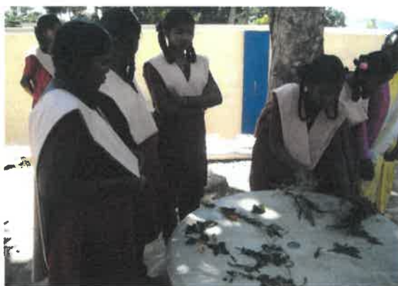
Above: students at Garikyur village school telling us about the medicinal plants to be found around their village.

The school garden acts as a realistic laboratory of learning for biology and environmental studies, where facts learned in the classroom can be applied practically. Gardening also enhances cooperation among peer groups and the students acquire social skills. Not only do the children learn the names of plants, but they also learn about pests and predators in the ecosystem, thus gaining a holistic sense of biological thinking. In today's educational system at village level parental involvement is of utmost importance.