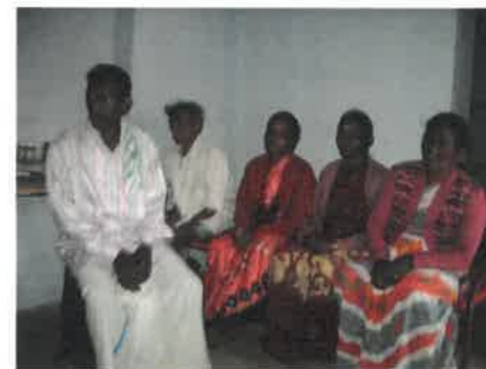
Above: Five traditional healers meet at Kadosolai village where they have converted a building into a health clinic

There are 7 healers working with 'the team'. Knowledge sharing and capacity building between healer and VHO has begun and there are a further 18 healers who have come forward to allow their knowledge to be documented (out of a total of 64 healers, so 25/64 in total). The project seeks to work with these practitioners so that not only is their knowledge documented but available to hand down to future generations. It is essential that traditional knowledge is not lost.