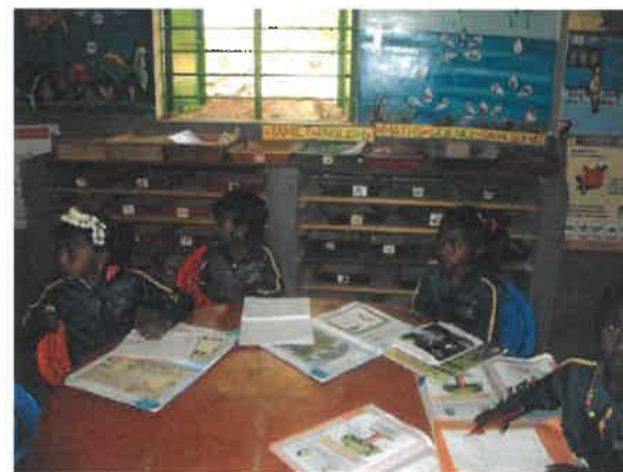
Above: the classroom environment at Kesalada school.