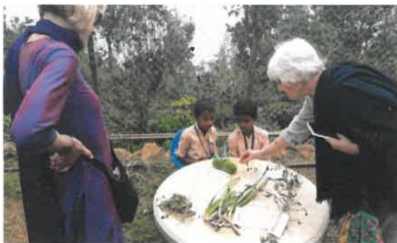
Above students at Pudur school