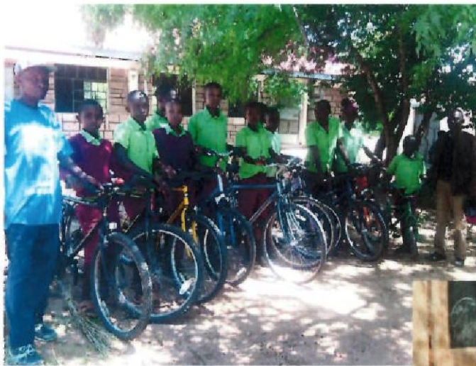
Our bikes in and around Gai, North Eastern Kenya, with their new owners