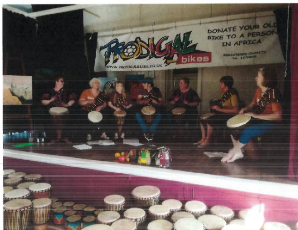
Africa Night 2 at the Merriott Village Hall