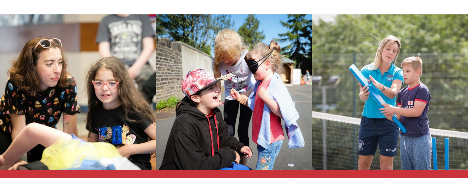
Registered Charity Number: 1169686 (Previously 1124020)