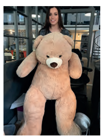
We sent small toy bags to Nairobi