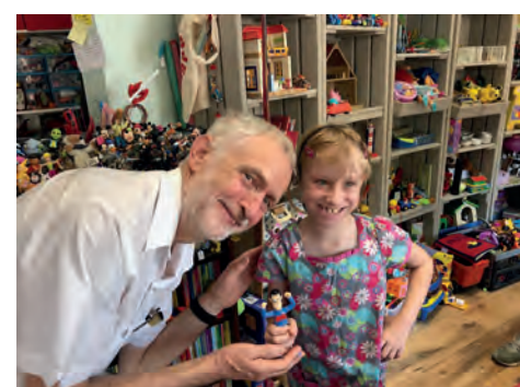
We held a FREE TOY day for teachers, parents and children to help themselves!