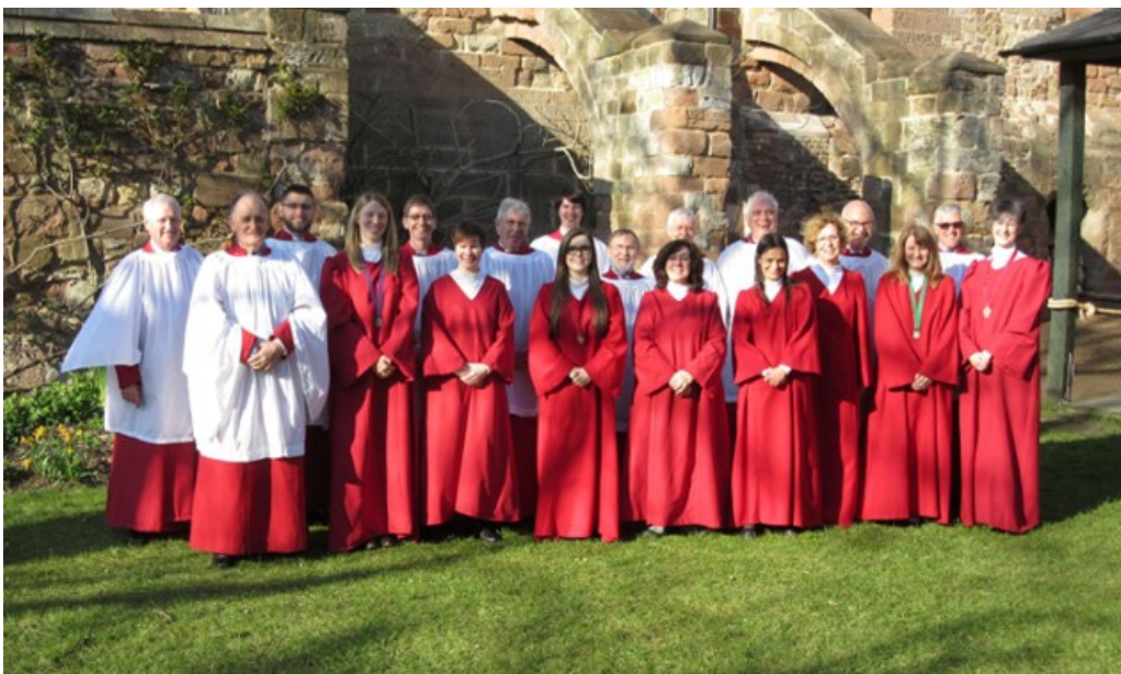
The Choir resplendent in robes at Worcester Cathedral