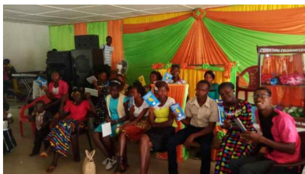
A colourful church service