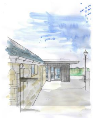
View From Gate

In August, in close association with Llandaff Society, we launched our Llandaff 50+ Pound Founders scheme which demonstrates the community commitment to the vision of the new Pound Centre.