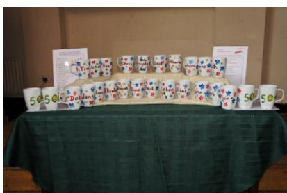
Left: our Pound Founder mugs

In August, in close association with Llandaff Society, we launched our Llandaff 50+ Pound Founders scheme which demonstrates the community commitment to the vision of the new Pound Centre.