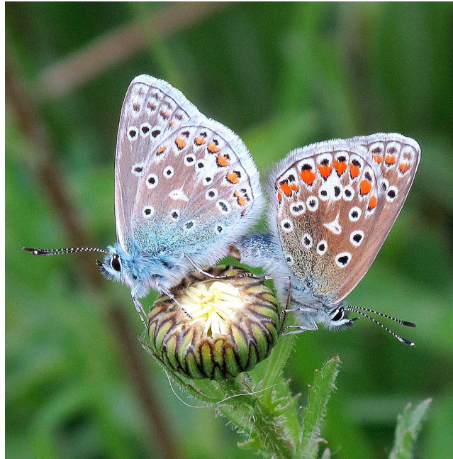
Common Blue butterflies at Carymoor