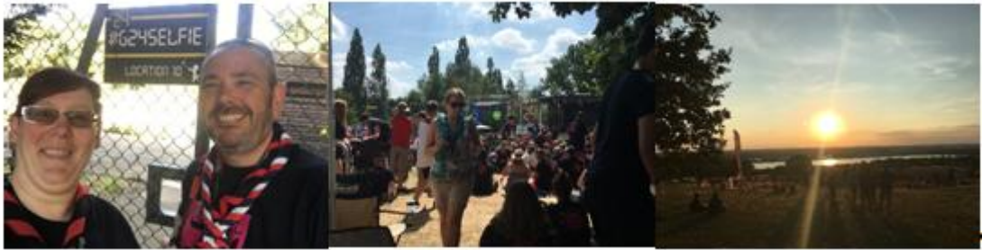
Investing in unusual places!