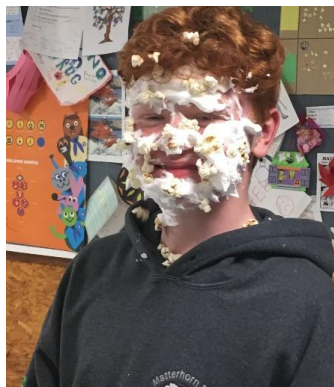
Popcorn & Shaving Foam game