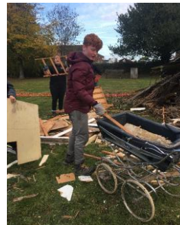
Building The bonfire