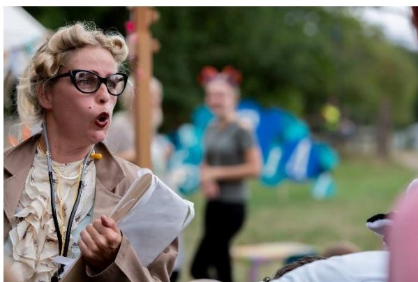
Anti Fun Ministry at Just So Festival

In the Summer 2018, Taking Flight performed The Anti Fun Ministry at The Just So Festival, and a new piece developed by Deaf and hearing performers; Honour and Cherish (BSL and English) at Big Splash in Newport and at The National Botanic Gardens of Wales.