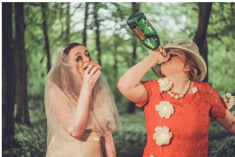
Honour and Cherish