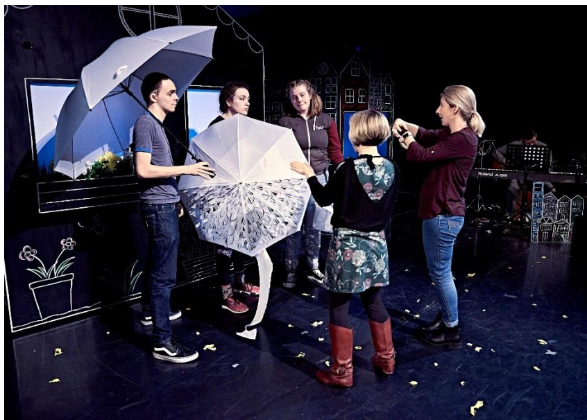
You've Got Dragons rehearsal

In addition to this, Dragons was invited to perform at Birr in Ireland as part of Hullabaloo Children's Theatre Festival. We worked with an Irish Sign Language translator and a Deaf ISL user to translate BSL into ISL in advance of a well-attended performance and multiple craft and practical workshops with children and their families at Birr Theatre.