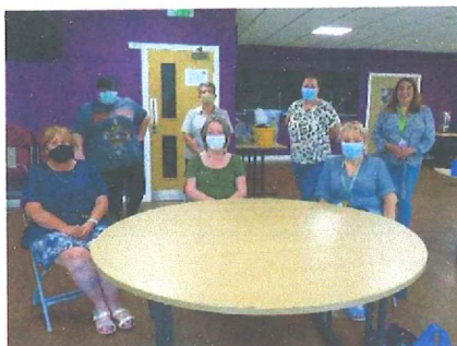
Some of the beneficiaries from our first ever Mindfulness Mandala Class