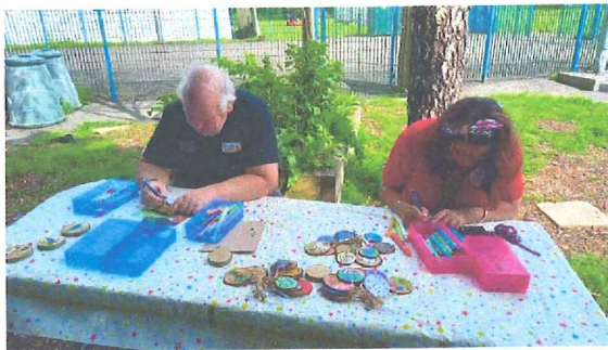
Work in progress with the collaboration with Valleys Steps.