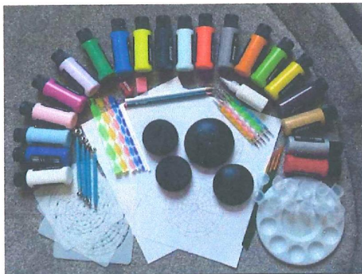
Some of the resources and equipment provided for the above classes