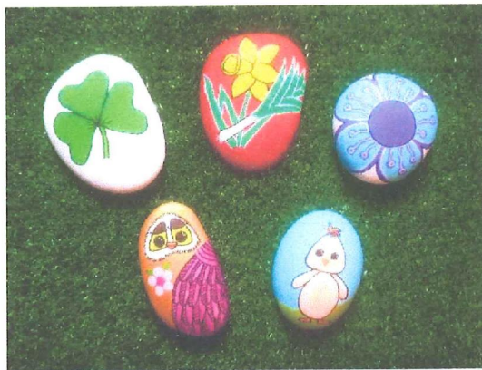
Examples of work resulting from various YouTube tutorials given freely

The financial statements comply with the Charities Act 2011, the Charity Constitution, and the Statement of Recommended Practice – Accounting and Reporting by Charities (SORP 2005)