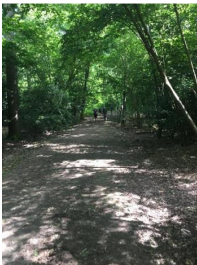
A Leader training walk when groups of 6 were allowed to meet outdoors