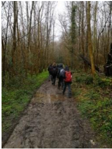
A Bronze expedition training walk