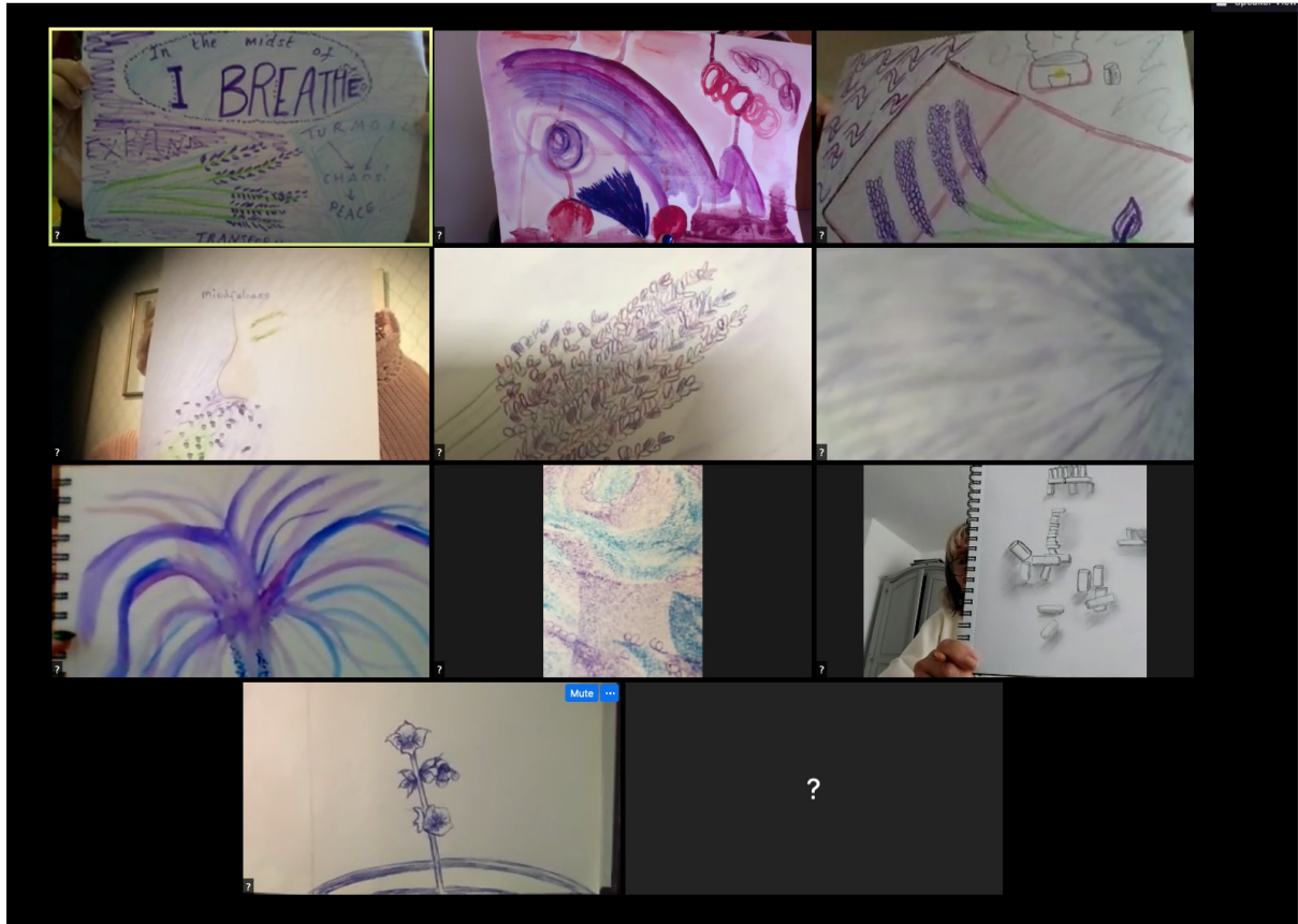
Screenshot from a Remote Connectivity Zoom session, November 2020.