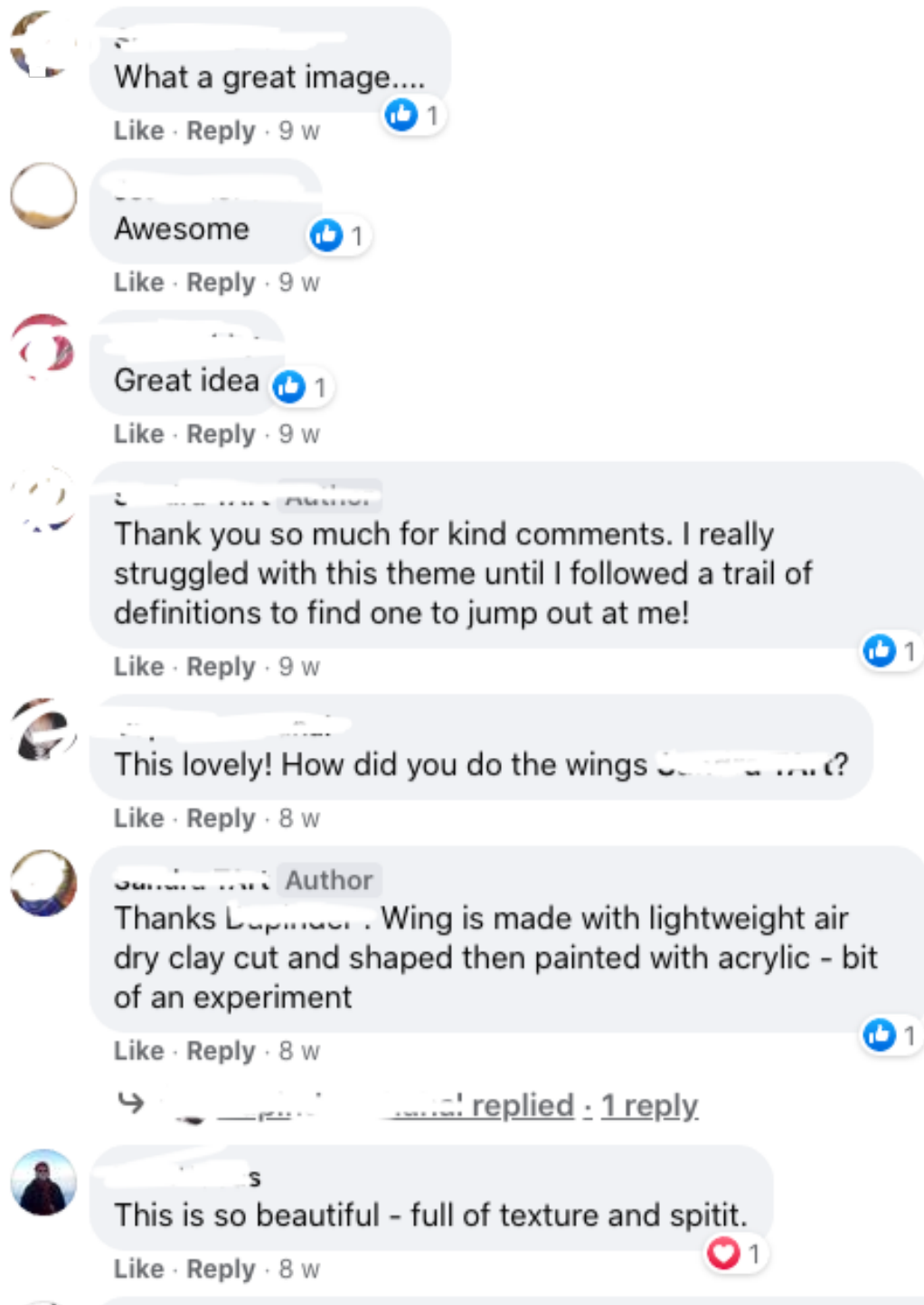
Artwork created for Remote Connectivity and anonymised responses from group members on closed Facebook group.

TRUSTEES ANNUAL REPORT (continued) YEAR ENDED 31 MARCH 2021