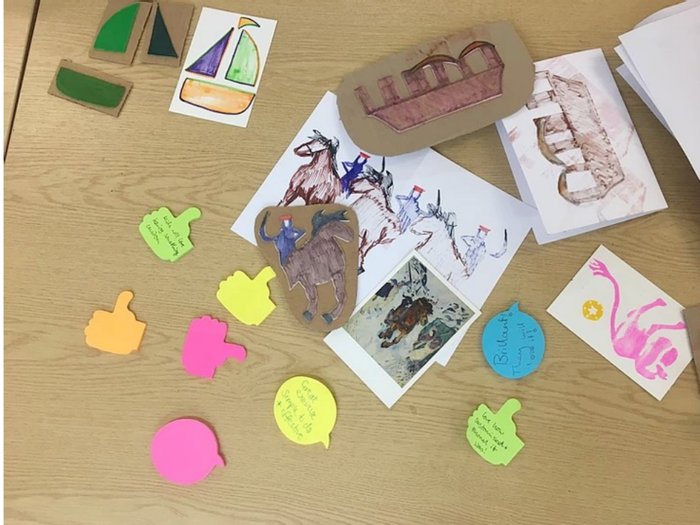
Artwork created by young people attending sessions at the Priory Hospital, Roehampton.