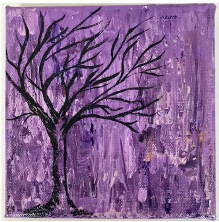
Diana Nicholls, "The Dance of the Tree", response to 'The Colour Purple' (Remote Connectivity Group)