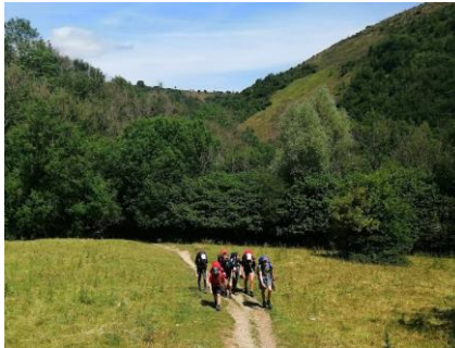
A silver team on their expedition, away in the Peak District

The following reports describe how the charity meets its aim.