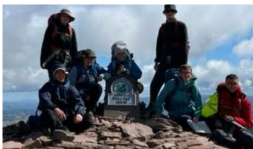
A gold team away in Wales at the top of Pen Y Fan