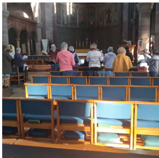
Dutchman Community Chorus Workshop 2022