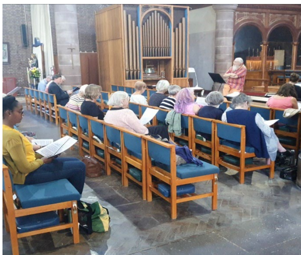
Dutchman Community Chorus Workshop 2022

Future plans are to continue the learning and participation programme by hosting 2 further chorus workshops in 2023 in order to create a committed community chorus for the planned performances in 2024. The trustees have recognised that further work needs to be done to increase participation and recruitment from BME communities as diversity was still an issue, challenges due to the historic lack of access for opera in the West Midlands and the COVID pandemic. The trustees remain confident that these issues can be addressed.