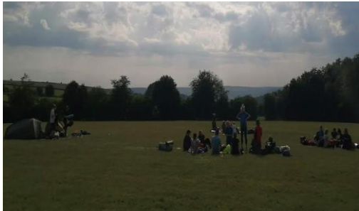
Some silver teams arriving at camp on their assessed expedition in the Peak District

The following reports describe how the charity meets its aim.