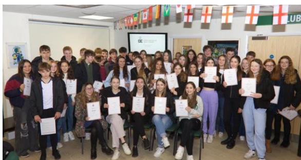
Many of the achievers attending the 2022 presentation evening