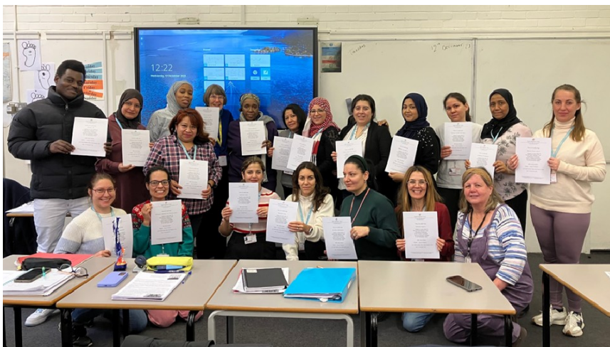
Lewisham College students proudly displaying certificates of thanks for raising £640.70 in the Christmas Challenge Week