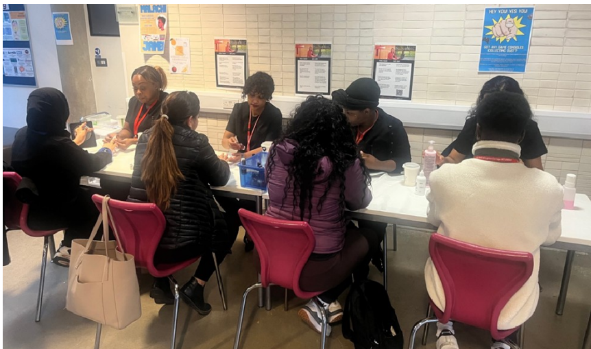
Manicure sessions by City and Islington students, in aid of the Ruth Hayman Trust

We always encourage student fundraising and have received donations from projects like food sales held in ESOL classes. This year we had generous contributions from Newham Learning and Skills, Lewisham College, City and Islington College, and Manchester Adult Education Service.